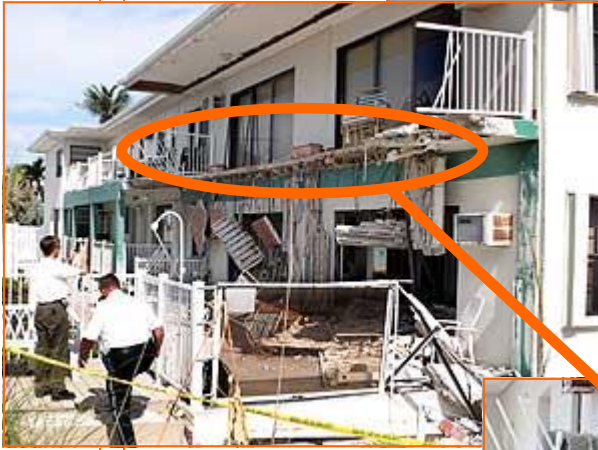
2006 4564 El Mar Dr. Lauderdale by the Sea, Fl. Balcony Collapse