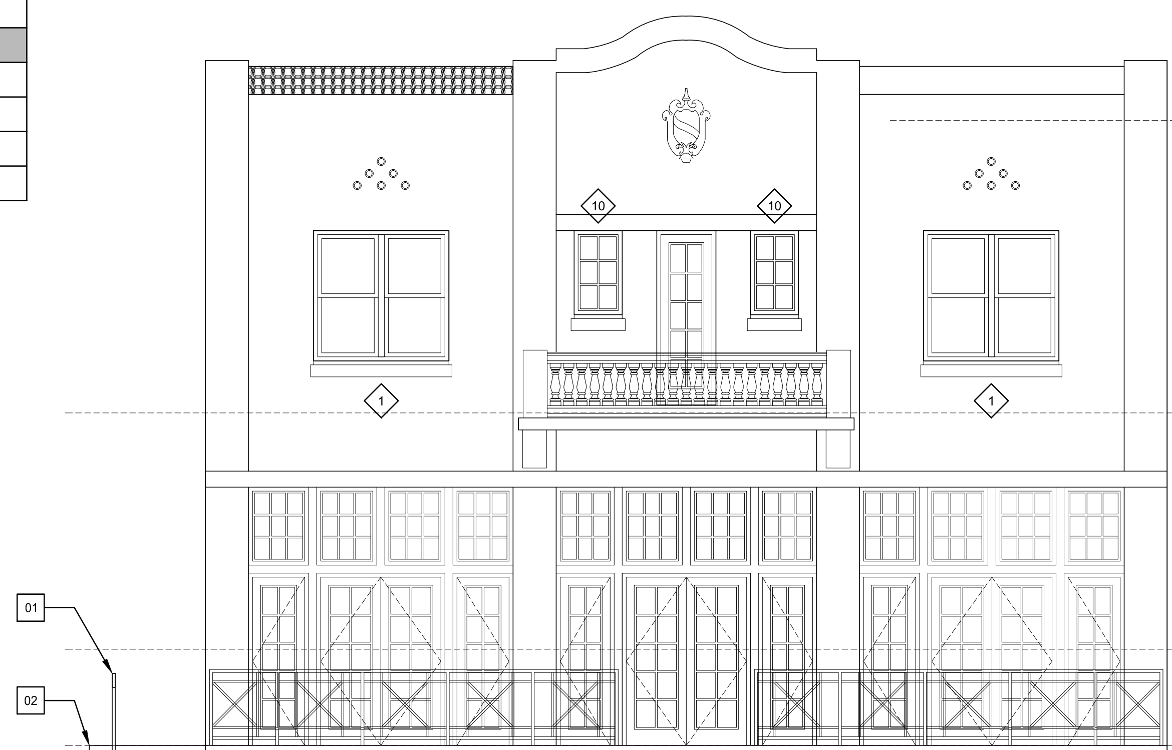
04 PROPOSED SOUTH ELEVATION 1/8"=1'-0"