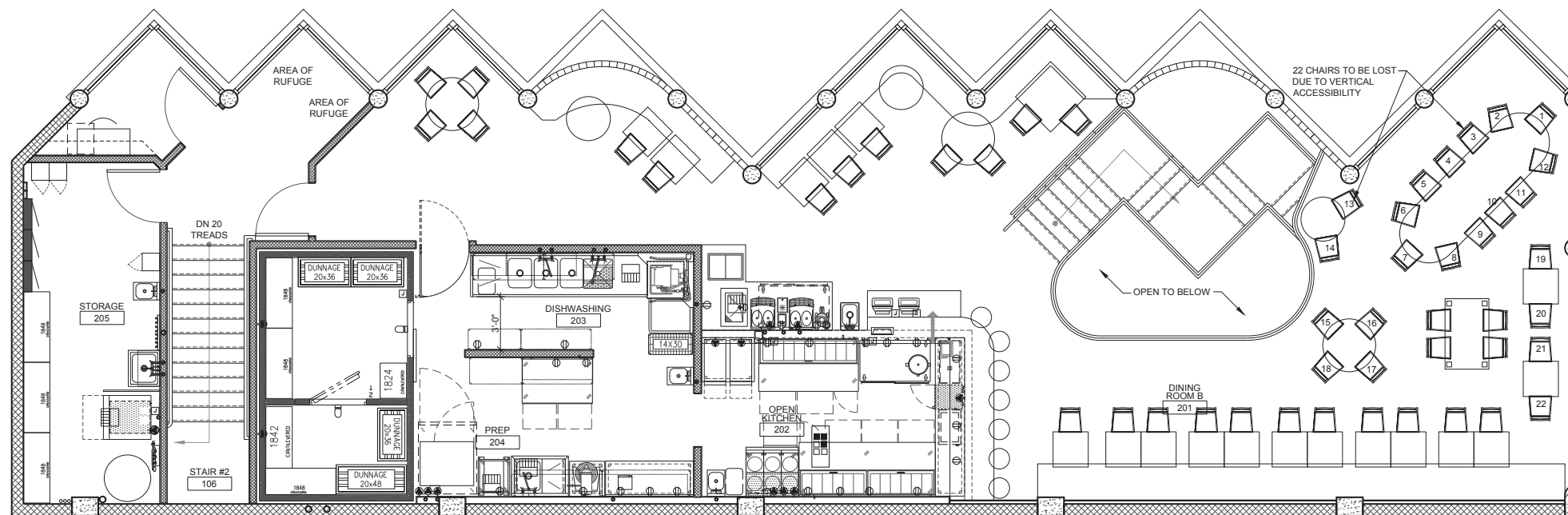
1 SECOND FLOOR PLAN 1/4"=1'-0"