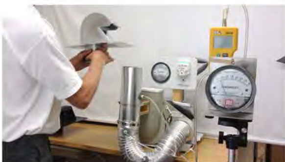
Using the blower unit from an electric dryer and a Magnehelic Gauge we ran some random pressure testing on popular roof vent caps. Back pressures provided in some were equal to what three or more elbows would provide.