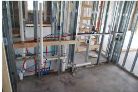
Examples of "mechanical walls" showing the abundance of utilities in this wall, demonstrating the need to provide more than 3.5"

Cost Impact: Will increase the cost of construction There is an added cost of adding furring strips to a 2 x 4 wall.