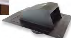
.30 inches of water column pressure 3 times as much as a typical elbow