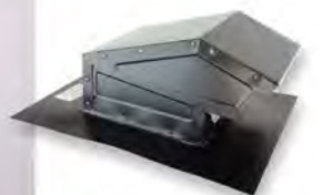
.21 inches of water column pressure 2 times as much as a typical elbow