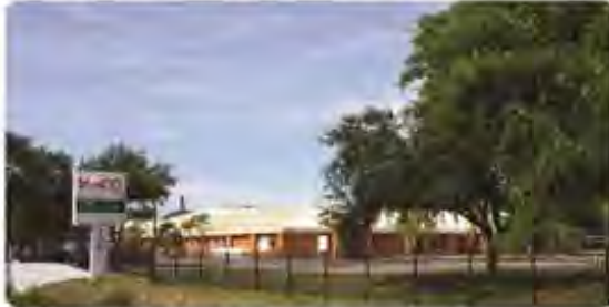
VizCO Corporate office in Bradenton, Florida.