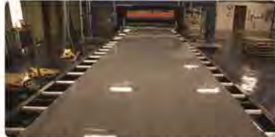
Extrusion line at the Monticello, Florida factory.

SecureFLX is designed to be safer and physically outperform every other drain pan at a superior price point. Our goal is to provide a product with the following characteristics: self extinguishing, low smoke, flexibility, extreme strength and to perform without failure at a higher temperature range than any other non-metallic solution. The result is a cost effective material unlike anything on the market.