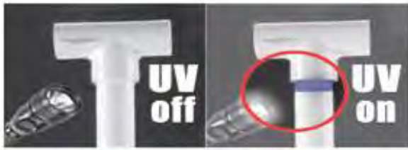
Inspector can verify the use of Primer with a UV flashlight.