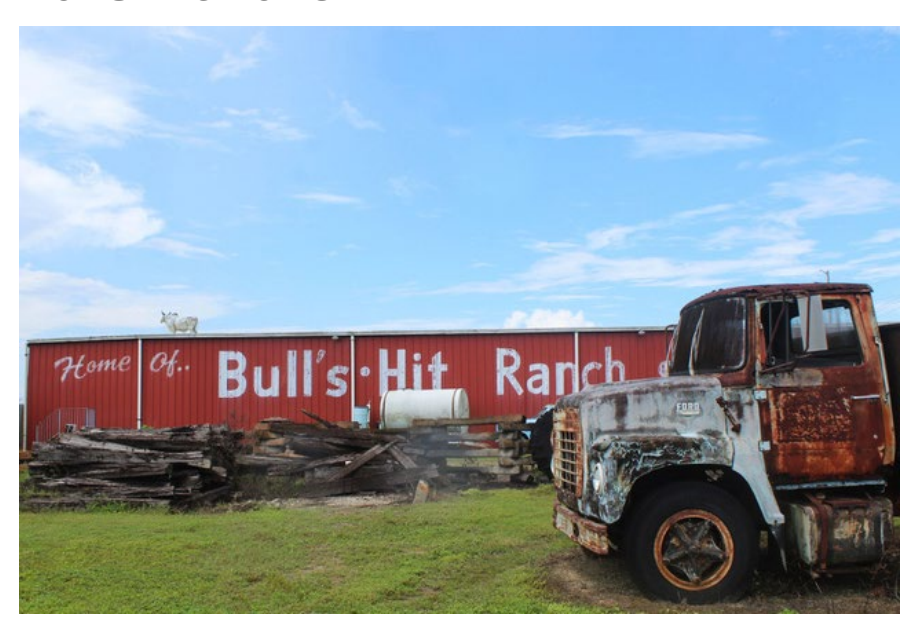
Bull's-Hit Ranch & Farm

Bulls-Hit Ranch & Farm is located in Hastings, Florida's self-proclaimed Potato Capital. The 1,500-acre farm along State Road 207 grows potatoes — white, Yellow Gold, and Atlantic — and cabbage, broccoli, cauliflower, corn, and hay. Bulls-Hit is best known for its delicious potato chips, Bulls Chips, which are no longer produced. They were thick, crunchy potato chips, fried by hand in kettles of cholesterol-free peanut oil, and sold at County Line Produce and other area stores. Launched in 1995, Bulls Chips sold about 52,000 bags a year.