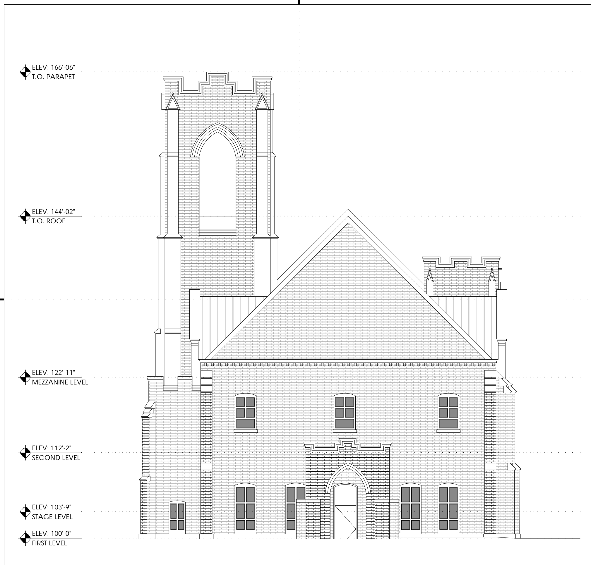
4 1/8"=1'-0" EXTERIOR ELEVATION