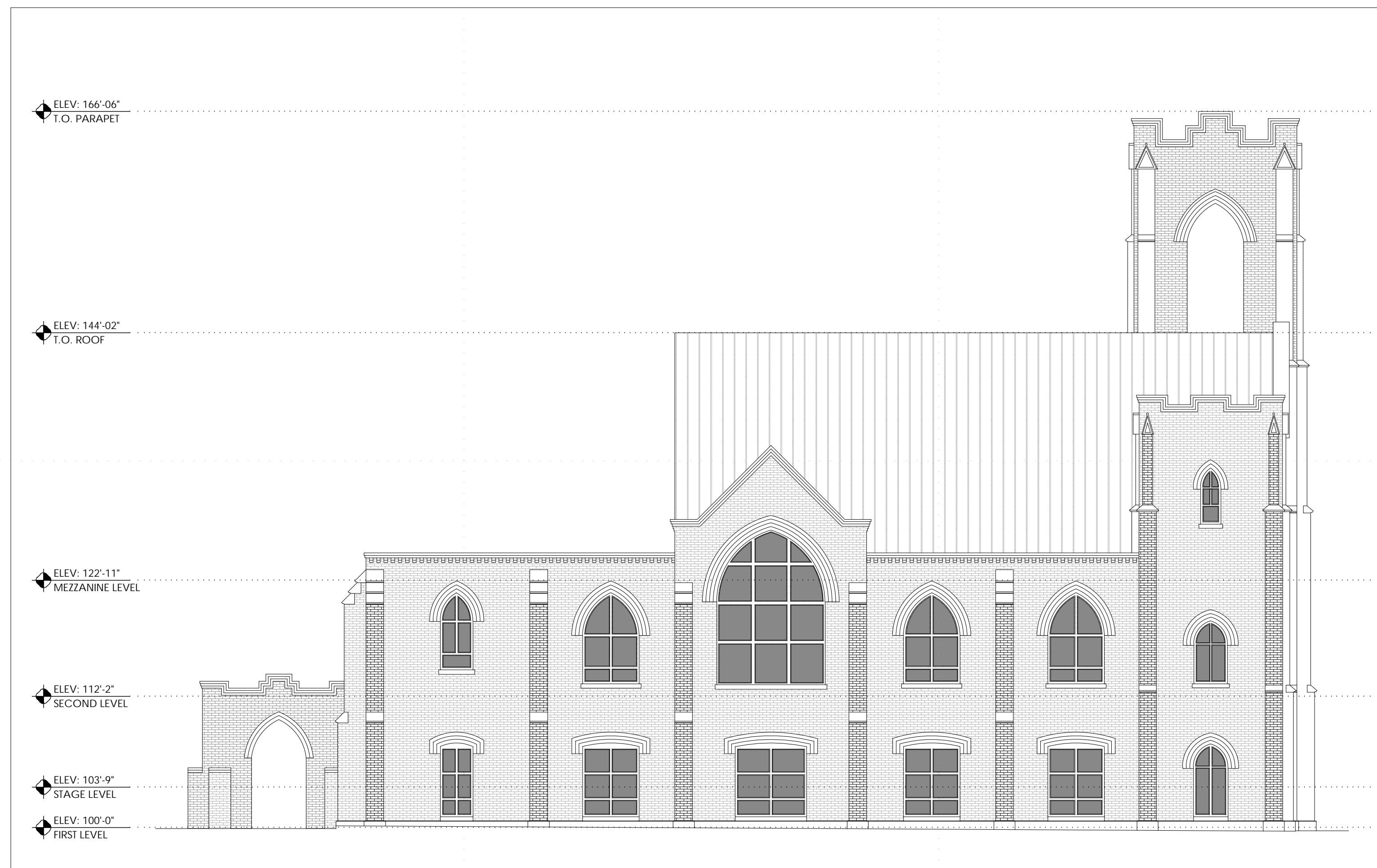
1 1/8"=1'-0" EXTERIOR ELEVATION :: NORTH