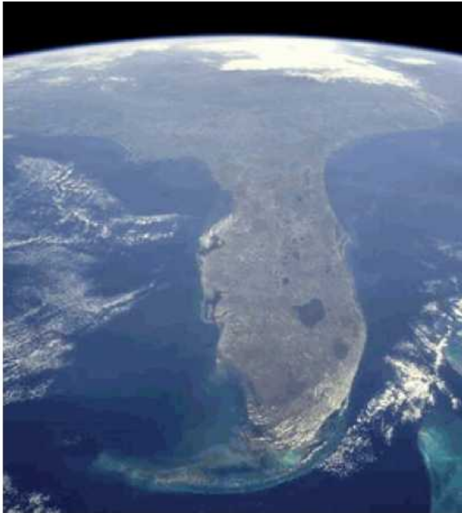
Florida Peninsula – From Space