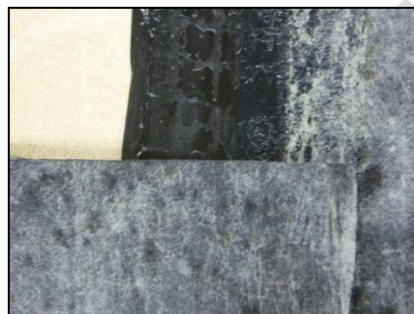
View of Overlap Seam of HydraGuard Dual Pro and HydraGuard Tile Pro