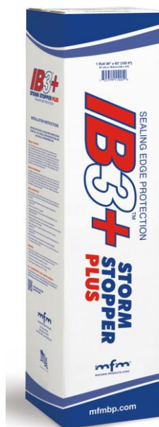
IB-3™ StormStopper Plus - Carton View