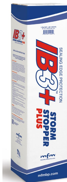
IB-3 TM StormStopper Plus - Carton View